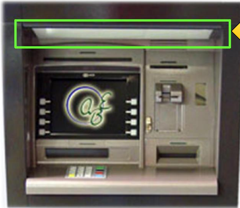
Photo shows a PIN capturing device fitted to the top of the ATM. These devices are usually difficult detect.